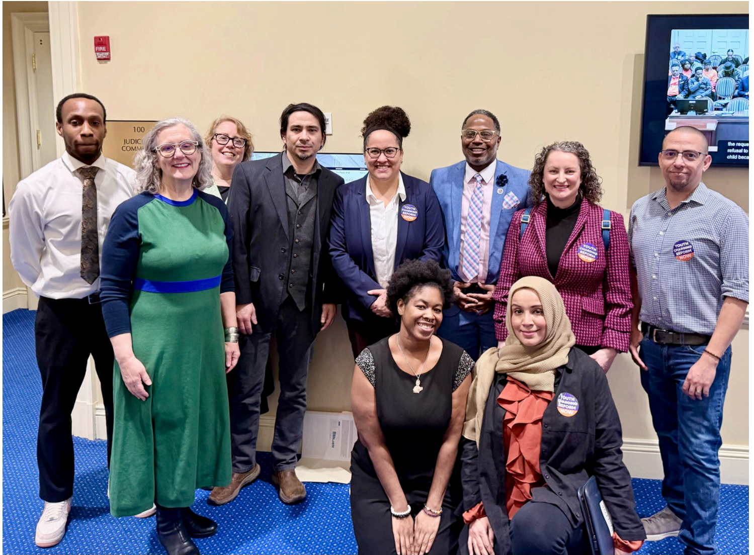
Photo: MYJC members gathered for Youth Charging Reform Act hearings

Along with the hundreds of letters our coalition members have sent directly to legislators, we have packed the room for the hearings at both the House and Senate, along with providing powerful testimony. Many thanks to those who joined us!