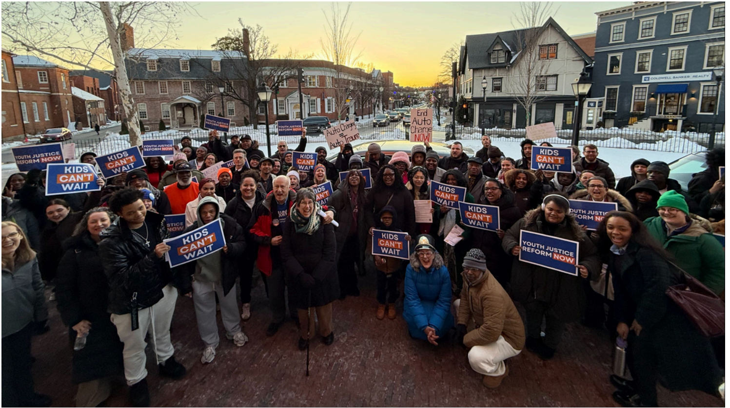
Photo: Participants of MYJC Lobby Night holding signs that say "Kids Can't Wait" and "Youth Justice Reform Now"

We had over two dozen scheduled lobby visits and our coalition members from the Eastern Shore to western and southern Maryland made sure to also engage in drop-offs of our literature making it clear that autocharging kids as adults has no reason to continue in Maryland.